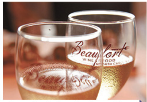
Clockwise from top left: Hilton Head Island Wine & Food Festival; South Warton Beaches Wine and Food Festival; Jason Isbell at Sea Island's Southern Grown festival; Beaufort Wine & Food Festival; Steven Satterfield at the Music to Your Mouth festival in Bluffton, South Carolina.