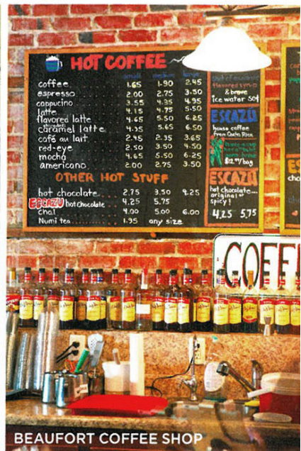
BEAUFORT COFFEE SHOP

Indulge your sweet tooth with old-fashioned, handmade fudge at The Fudge Factory. Choose between classic flavors of vanilla and chocolate or scrumptious butter pecan and peneuche. Find more delicious souvenirs down the street at Beaufort Olive Oil Company. Take the local flavor home with one of its premium extra-virgin olive oils, aged balsamic vinegars, and gourmet and flavored salts. Finally, recharge with a delicious cup of coffee or a glass of wine just around the corner on Turner Street at Cru Wine Bar and Beaufort Coffee Shop.