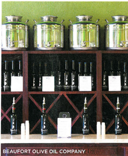
BEAUFORT OLIVE OIL COMPANY