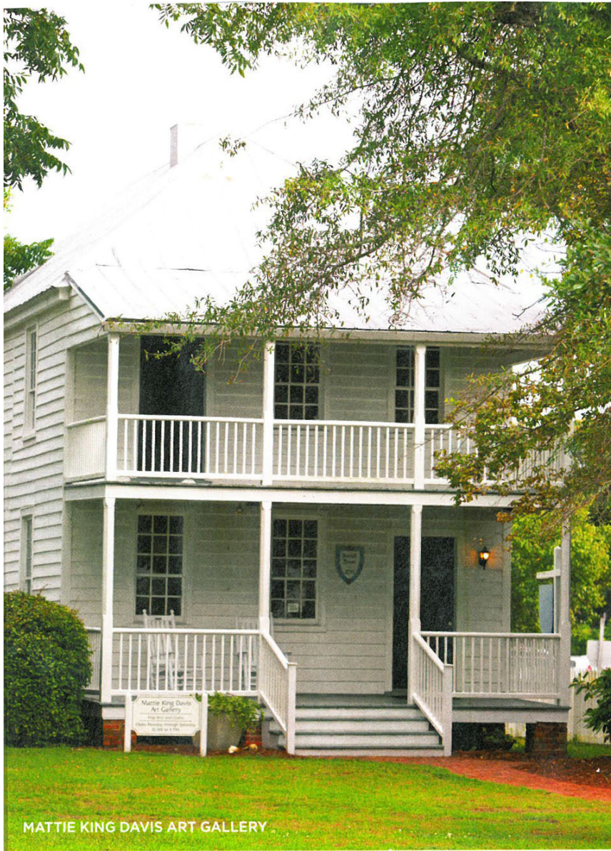
MATTIE KING DAVIS ART GALLERY