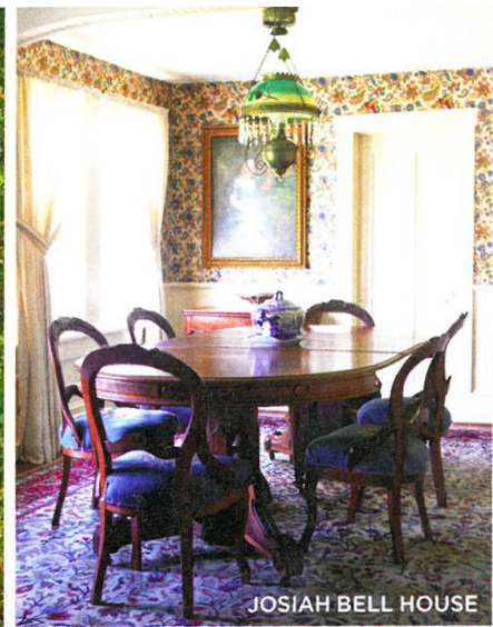
JOSIAH BELL HOUSE