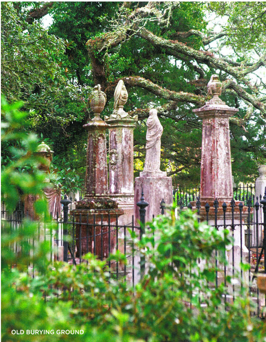
OLD BURYING GROUND