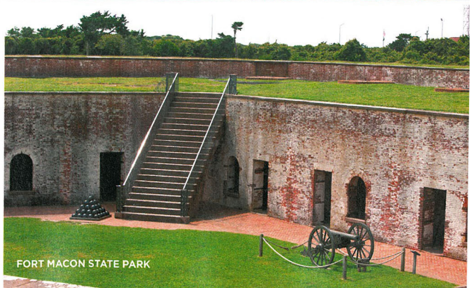
FORT MACON STATE PARK

Indulge your sweet tooth with old-fashioned, handmade fudge at The Fudge Factory. Choose between classic flavors of vanilla and chocolate or scrumptious butter pecan and peneuche. Find more delicious souvenirs down the street at Beaufort Olive Oil Company. Take the local flavor home with one of its premium extra-virgin olive oils, aged balsamic vinegars, and gourmet and flavored salts. Finally, recharge with a delicious cup of coffee or a glass of wine just around the corner on Turner Street at Cru Wine Bar and Beaufort Coffee Shop.