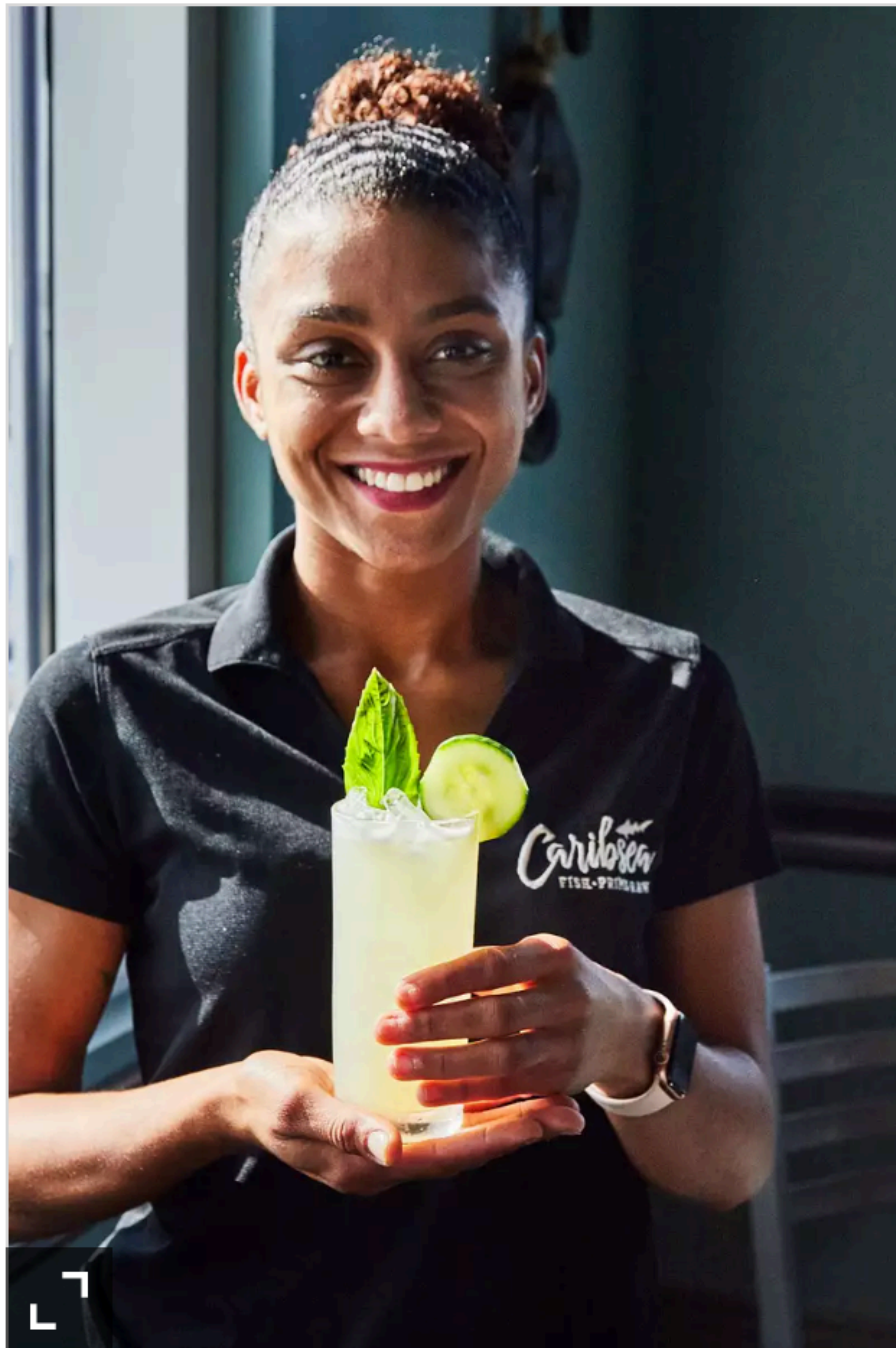
Left: Order a Caribsea Collins

Seafood is king here, and you will find so many ways to savor it. Meet on the pier for a family meal at Surf's Up Grill & Bar . (Don't miss out on the grouper sandwich.) For date night, start with a cocktail from Kathryn's Bistro & Martini Bar , which serves more than 30 variations on the classic drink. Then pop down the street to Caribsea for dinner; the fish is local and sustainably sourced.