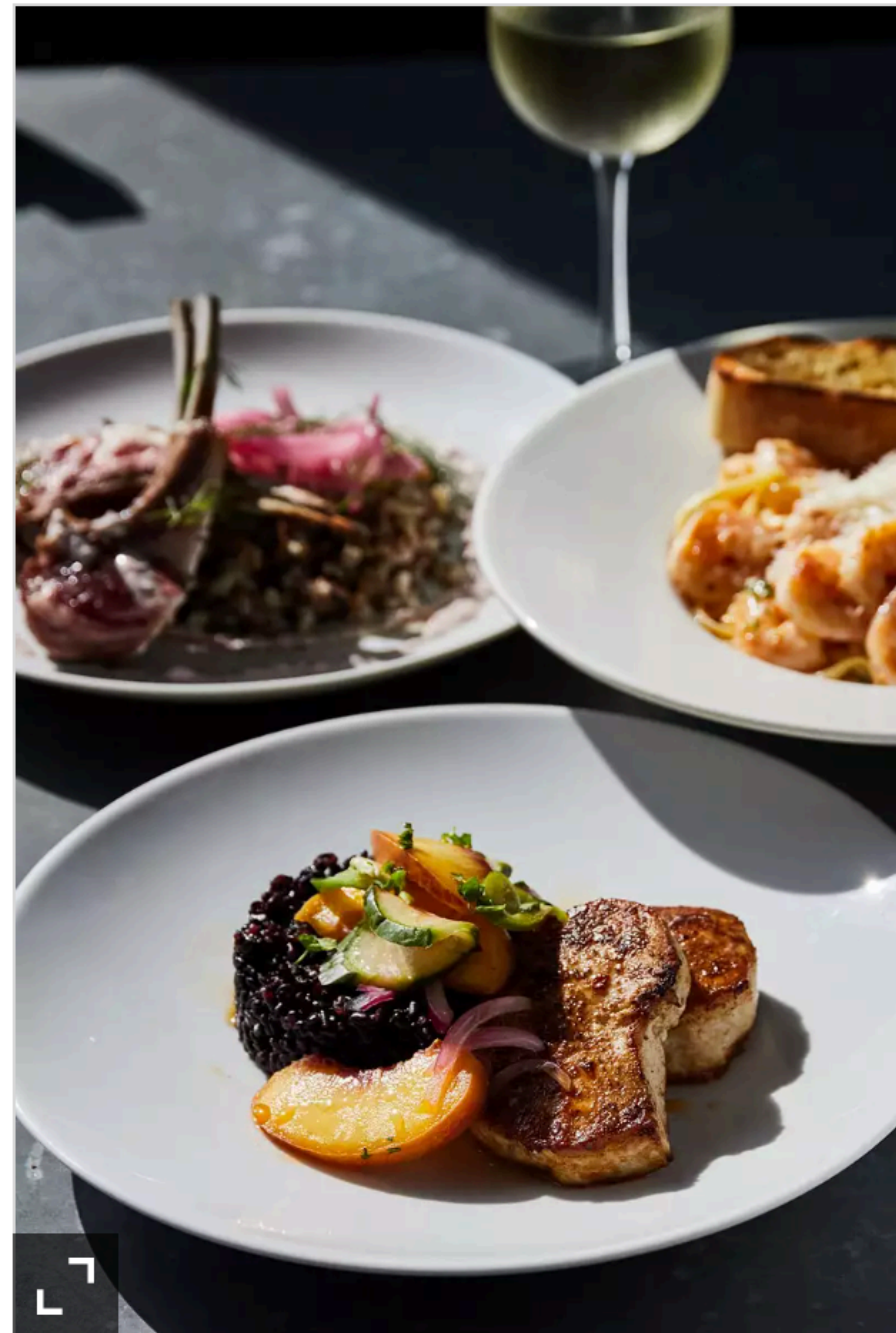
Right: There is plenty to choose from at Caribsea

If you're in town on a summer Thursday, head to the weekly outdoor concert series, EmeraldFest, for live music. Afterward, wander over to Flipperz Family Bar & Grill to order oysters and apps plus a cold beer.