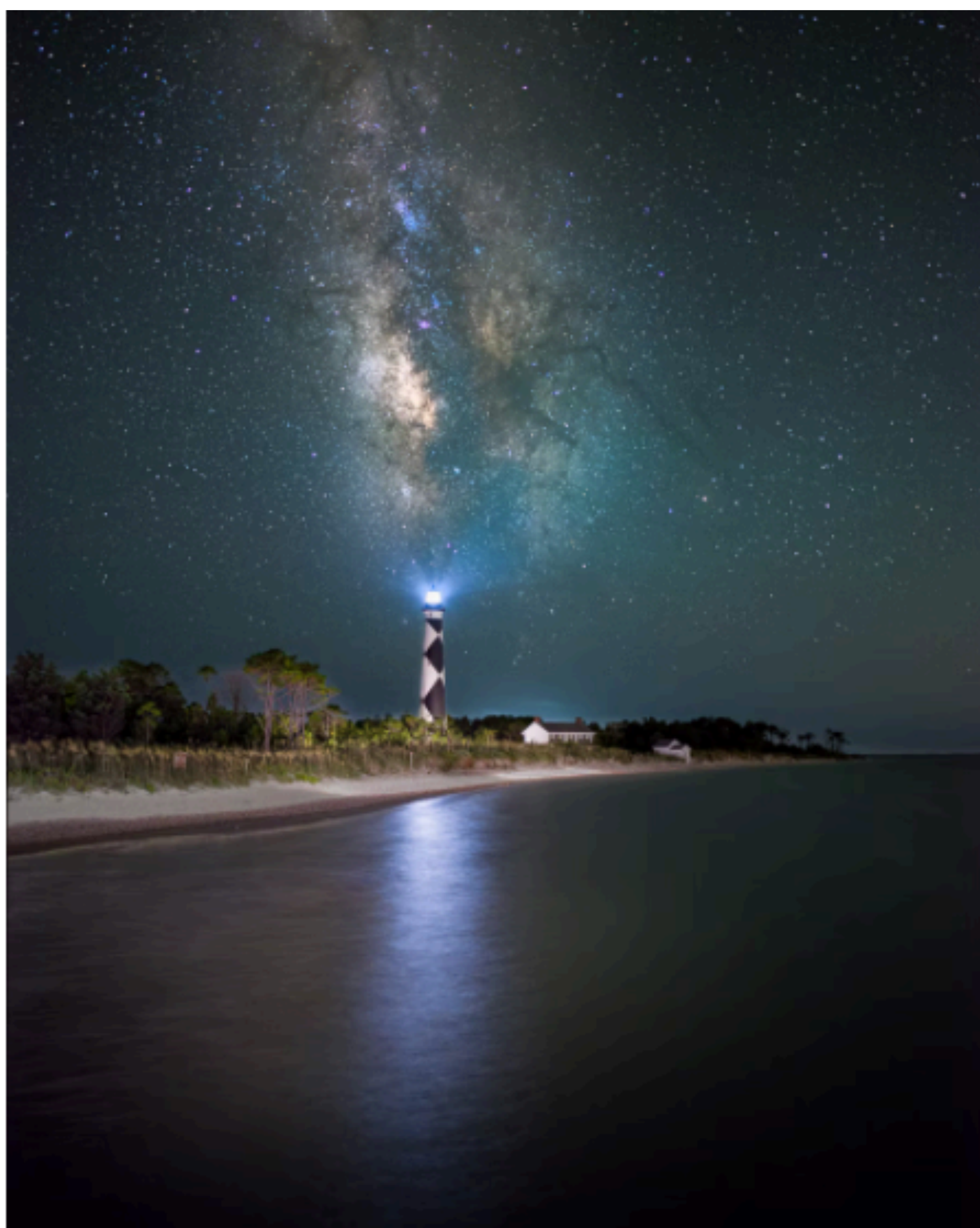
Crystal Coast Stargazers/Alex Gu

Naturally, a destination that lends itself to starry night skies will also be somewhere beautiful, making the decision to find these sorts of places all the more strong. A few things to consider: "If you can, the AAVSO recommends observing at national parks that are certified as dark skies parks. The National Park Service has a list of 27 national parks recognized by the International Dark Sky association for their dark night skies," he says. If you're not in a dark sky area, all you need is a pair of binoculars or a small telescope. "The AAVSO recommends selecting a location where you can see the sky (dense trees will not help) and that's far away from light pollution. Also, stargazing is more fun if the moon is not full, so it is recommended to pick days close to the new moon (the 'invisible' moon)."