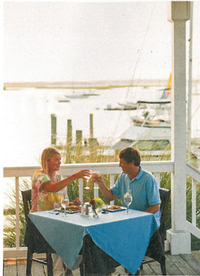
Waterfront restaurants offering fresh-from-the-dock seafood are plentiful in Beaufort.

Later in the week, we take advantage of the ideal weather conditions to head out of the inlet and run the 6 miles to Cape Lookout National Seashore, where we drop the hook in 6 feet of water near Day Beacon 6. Well protected from the ocean swell, we're surrounded by beautiful white-sand beaches and crystal-clear aqua