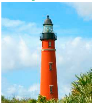
Ponce Inlet Lighthouse

National Historic Landmark and the tallest lighthouse in Florida