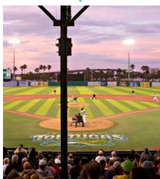
Jackie Robinson Ballpark

Features a statue of Jackie Robinson, historical markers, a museum, and home to the Daytona Tortugas baseball team