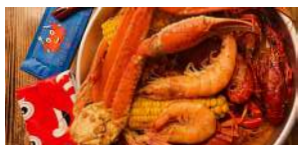
Local Seafood Favorites