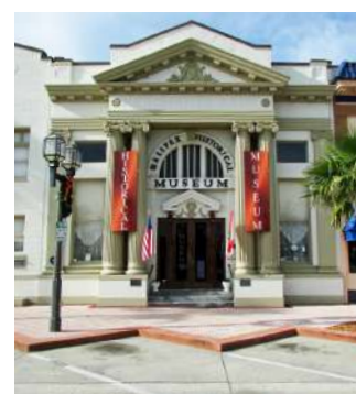
Halifax Historical Museum

Museum showcases the Daytona Beach area's history and ancient artifacts