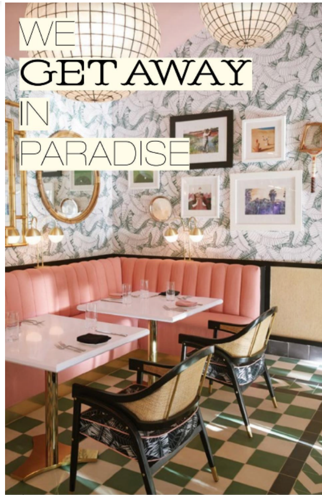
CLOCKWISE FROM TOP LEFT: The Pink Cabana restaurant at the Sands; the lobby at Azure Sky pays homage to the property's midcentury roots; Azure Sky's guest rooms feature custom millwork and built-in beds; the retro exterior.