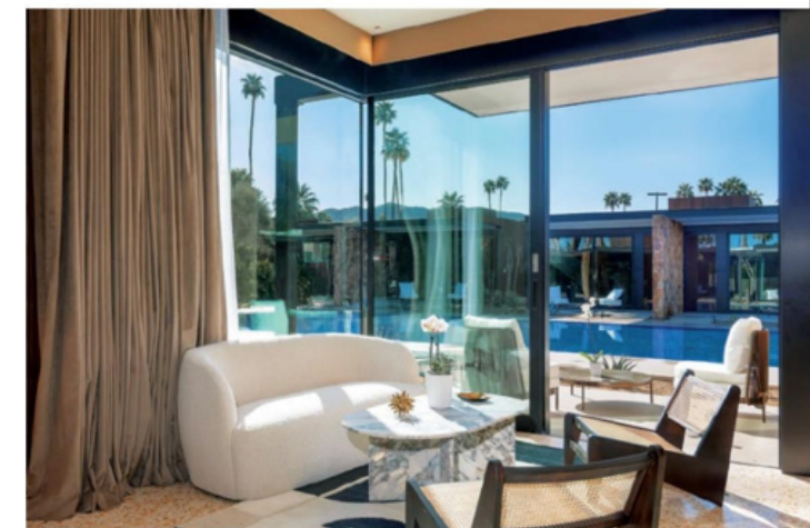
TOP TO BOTTOM: The zero-edge pool at Hermann Bungalows boasts serene mountain views; the 24 smartly appointed bungalows feature floor-to-ceiling windows.