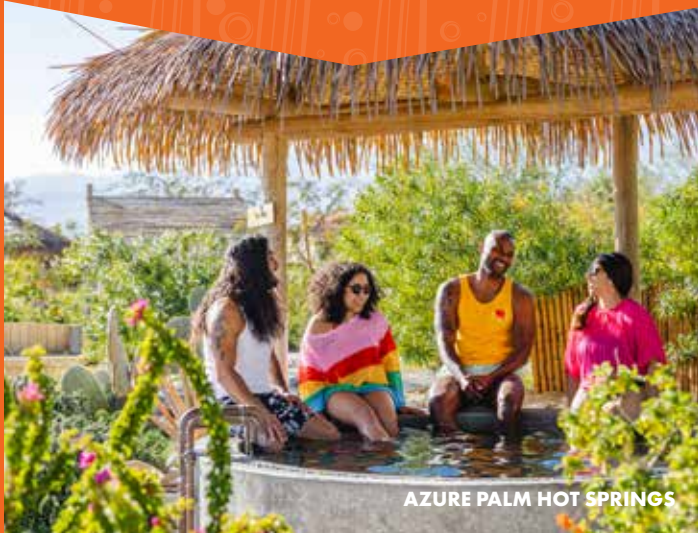
AZURE PALM HOT SPRINGS

Desert Hot Springs , also known as "California's Spa City," is home to some of the purest hot and cold mineral springs in the world, and its resorts and boutique hotels welcome overnight and day guests to soak in the waters. Nestled in the foothills of the San Bernardino Mountains just north of Palm Springs, the city's unique geology has made it a world-famous destination.