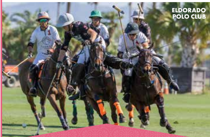
ELDORADO POLO CLUB