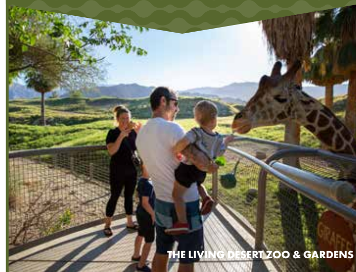
THE LIVING DESERT ZOO & GARDENS

Palm Desert is a center for shopping, entertainment, and recreation. Visitors can catch a show at the McCallum Theatre , visit the Living Desert Zoo & Gardens , shop on El Paseo , tour several international art galleries, cheer on the Coachella Valley Firebirds hockey team at Acrisure Arena , or head outdoors on one of the hiking trails in the foothills of the Santa Rosa Mountains .