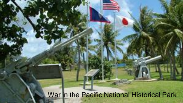
War in the Pacific National Historical Park