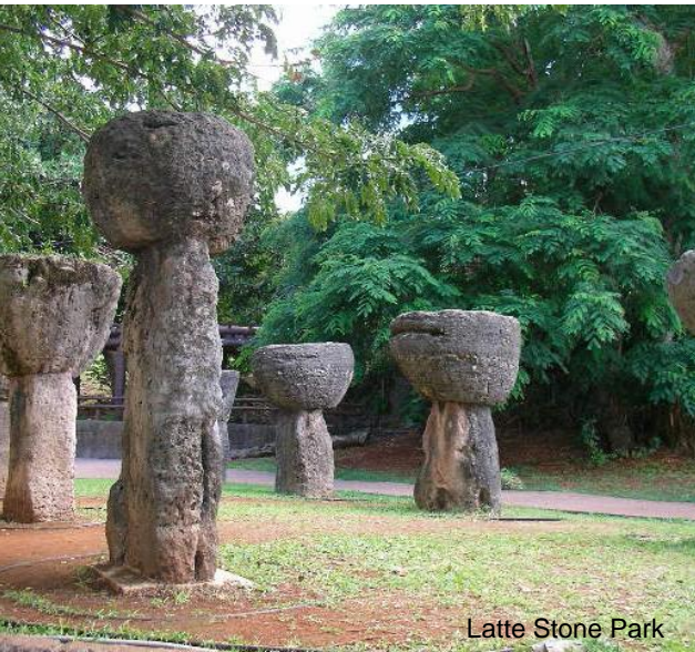
Latte Stone Park