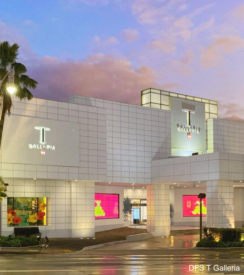
DFS T Galleria