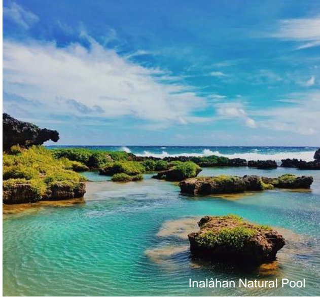
Inalåhan Natural Pool