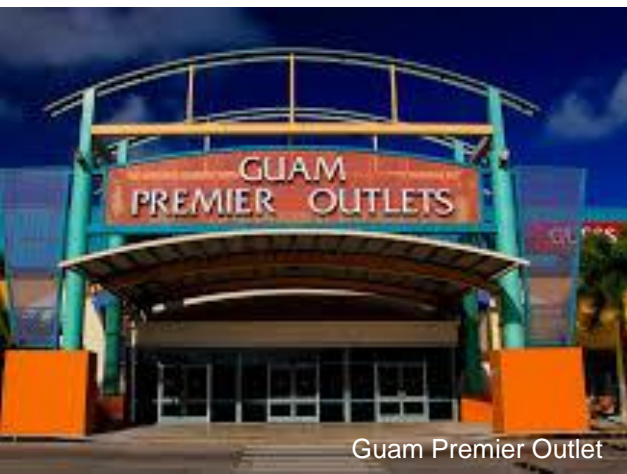
Guam Premier Outlet