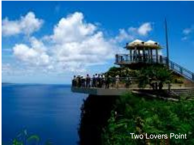
Two Lovers Point