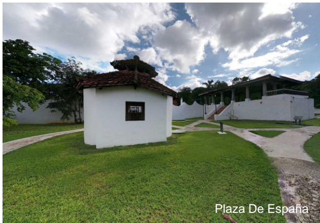
Plaza De España