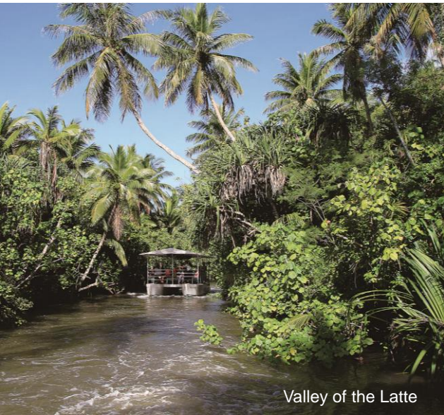
Valley of the Latte