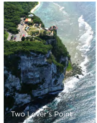
Two Lover's Point

A favorite among visitors, Two Lovers Point offers a breathtaking view and a look into the culture and history of the island. According to ancient folklore, two ill-fated lovers who had been forbidden to marry tied their hair together, then leapt to their deaths from this 378-foot-high cliff. The site offers a visitors center open daily and an unmatched view of the island. For more info, call 1 (671) 647-4107.