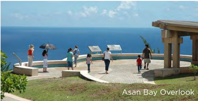
Asan Bay Overlook

South Pacific Memorial Park - To commemorate all those who died on Guam during World War II, a Japanese non-profit group called the South Pacific Memorial Association Mission funded construction of this memorial, completed in May 1970. Located just off Marine Corps Drive at the foot of Mt. Matagi, it is known as the last Japanese command post. A 50-foot tower shaped like praying hands commemorates 500,000 Japanese lives lost in Micronesia throughout WWII.