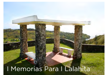
I Memorias Para I Lalahita

I Memorias Para I Lalahita - Dedicated in 1971 to the Guam men who died in Vietnam, this site offers an unmatched view of Guam's southern mountains. A 2-foot wall surrounding the memorial allows you to sit and admire waterfall valleys, mountain ranges, and Umatac village below.