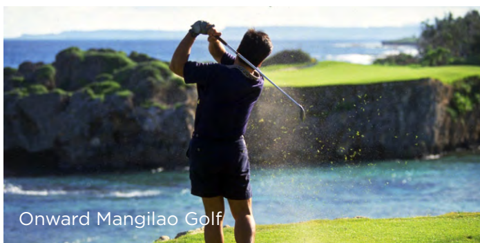
Onward Mangilao Golf

Golf: A round of golf in one of Guam's many courses is an opportunity well worth the effort. Seven courses ranging in environment and difficulty level are situated throughout the island, many of which were designed by golfing greats Jack Nicklaus and Arnold Palmer. A golf driving range, located close to Tumon (Guam's hotel district), is open until 10 p.m. Golf clubs, shoes, and other equipment may be rented at the pro shop. The island boasts top level golf courses - most with 18 holes - have pro and specialty golf shops at each respective clubhouse.