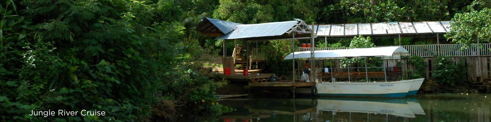
Jungle River Cruise