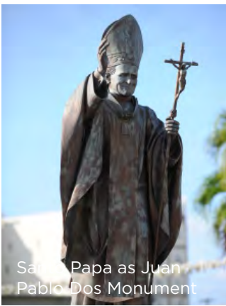
Santo Papa as Juan Pablo Dos Monument

Santo Papa as Juan Pablo Dos Monument - Across from Dulce Nombre de Maria Cathedral-Basilica in Hagåtña, a statue of Pope John Paul II commemorates the leader's first visit to the Marianas Islands in 1981. It rotates at a rate of one full revolution every 12 hours.