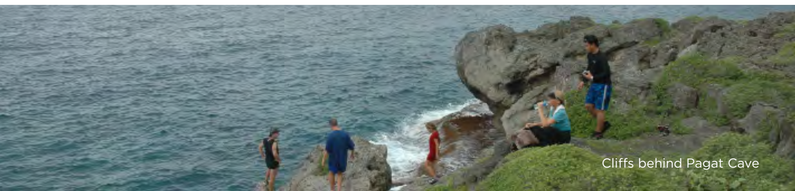
Cliffs behind Pagat Cave