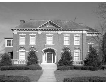
#5 HAROLD W. JEFFERY HOUSE 6331 Third Avenue (1909) Georgian Revival

The building has a steeply-pitched hipped roof and three gables on the front facade. Two-story bays project from the front facade and flank the front entry porch. A connecting wing between the convent and the chapel was also built at this time and is a five bay brick structure with a flat roof and gothic-arched windows.