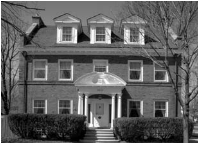
#19 COLE-THIERS HOUSE 6324 Third Avenue (1909) Georgian Revival

This two-story Georgian Revival red brick house features a steeply-pitched gable roof and parapeted end walls. Dominating the front of the