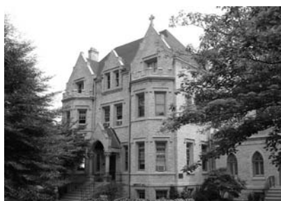
#1 KEMPER HALL (Kemper Center)

Finally, the overall appearance of the Third Avenue Historic District is of upper-class ambiance. The natural boundary of Lake Michigan to the east as well as the unusually large setbacks of the houses give the district part of its attractiveness. The district was developed as a prestigious residential neighborhood in the early twentieth century, and the prominent families, along with Kemper Hall, occupied their mansion-like homes in the district until recent years. Currently, many of the homes are still maintained by single families; however, prohibitive upkeep costs of some of the largest mansions has resulted in alternative uses.