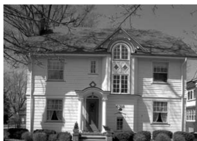
#18 FRED W. CARPENTER HOUSE 6318 Third Avenue (1915) Eclectic Revival