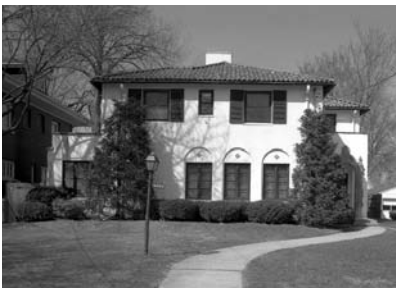
#20 ALEXANDER B. McCALL HOUSE 6334 Third Avenue (1922) Spanish Colonial Revival