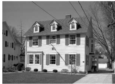
#23 EMORY GRANT HOUSE 6402 Third Avenue (1920-1921) Colonial Revival