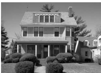
#13 GEORGE A. PUGH HOUSE 6208 Third Avenue (1904) Late Queen Anne

brickwork, and stone accents at the main entrance and elsewhere.