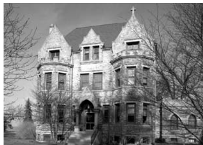
#4 CONVENT Kemper Center Grounds (1911) Gothic

This Gothic Revival chapel is built of cream brick and decorated with light stone window trim and red brick string courses and window moldings. It has a steeply-pitched roof with gables, wall buttresses, Gothic arched openings, and a polygonal vestibule. A large rose window above the vestibule decorates the front gable. Remodeling in 1906-1908 removed the original bell tower and added stone coping on the front gable and a bapistry to the vestibule.