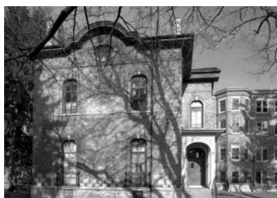
#2 CHARLES DURKEE HOUSE (Senator Charles Durkee Mansion) 6501 Third Avenue Kemper Center Grounds (1861, 1871) Italianate

Kemper Hall was the most significant private school in the community in the late nineteenth and much of the twentieth century. It began as an Episcopal girls' boarding school in 1865. Because of financial pressures, it closed in 1975. The complex is now owned by Kenosha County and is operated by Kemper Center, Inc. The grounds remain in a park-like state, and the buildings are used for various public and private purposes. Several of the buildings are executed in the Gothic Revival style; the connecting wings of the complex continue the Gothic theme. It was placed on the National Register of Historic Places in 1976.