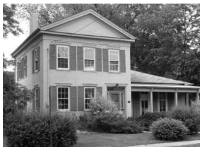
A – PATRICK ENGLISH HOUSE 6004 Third Avenue (1849) Greek Revival

This two-story Greek Revival brick house with a one-story wing has a gable roof, a full pediment, and a delicately molded cornice. A transom