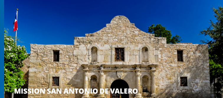
MISSION SAN ANTONIO DE VALERO

There are a broad range of events happening at each of the San Antonio Missions all year. Go to WorldHeritageSA.com