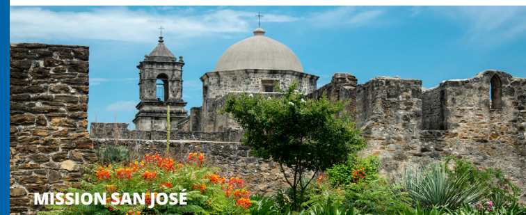
MISSION SAN JOSÉ