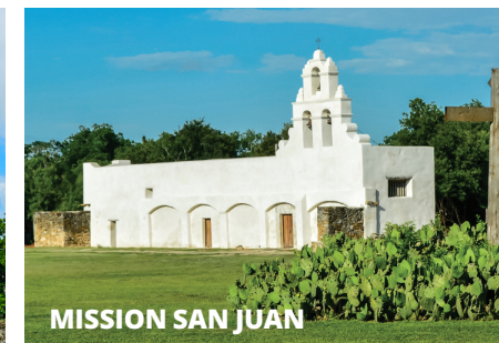
MISSION SAN JUAN

San Antonio's Missions symbolize an era when the world was expanding, cultures were intertwining, and the global landscape was forever changed. Today they remain a thriving religious center for many San Antonians and a historic destination for the entire world to enjoy.