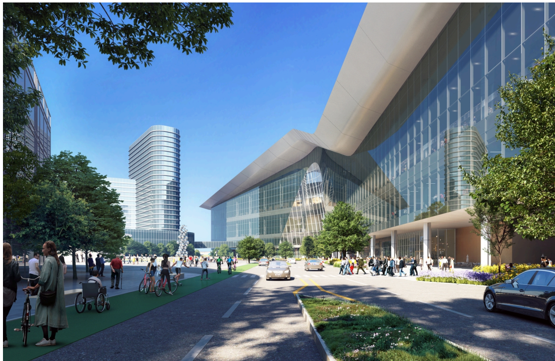
A conceptual rendering shows what the exterior of the $3.7 billion expanded Kay Bailey Hutchison Convention Center could look like in downtown Dallas.

City has been unable to reach an agreement with land owners, filing says