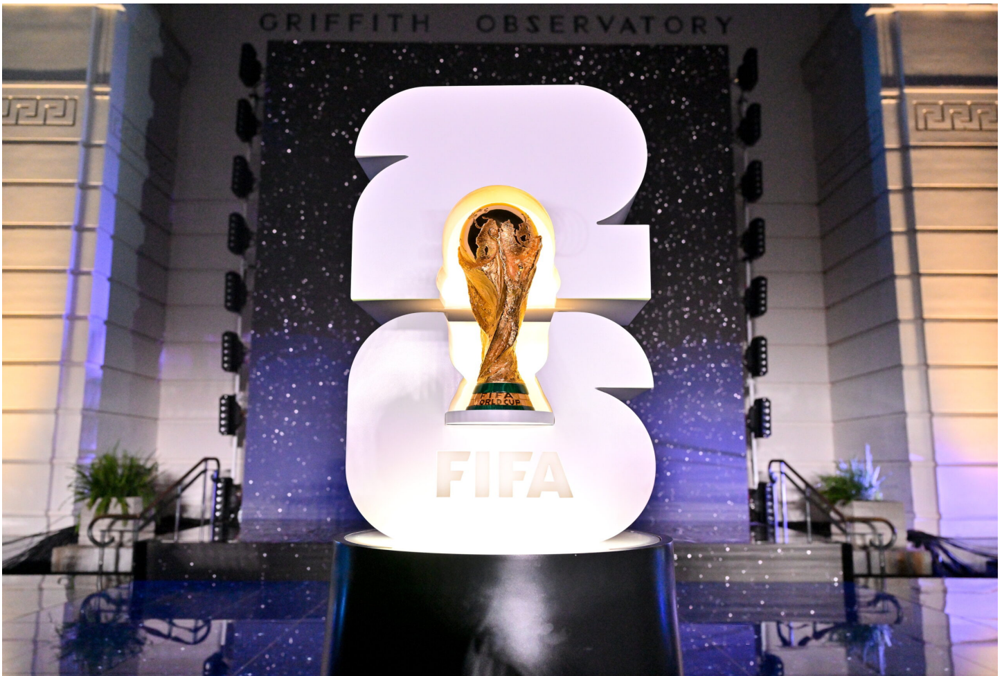
The FIFA World Cup Trophy is shown during the FIFA World Cup 26 Official Brand Launch at the Griffith Observatory in Los Angeles.

As anticipation started to build with the one-year countdown in June and continuing this summer for the 2026 FIFA World Cup ( https://www.sportstravelmagazine.com/tag/2026-fifa-world-cup/ ), there is something that nobody has been able to do just yet – promote the teams that will be playing in group stage matches, because the draw has not been made.