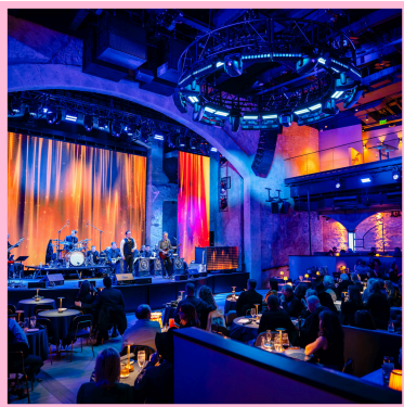
Live Music & Entertainment