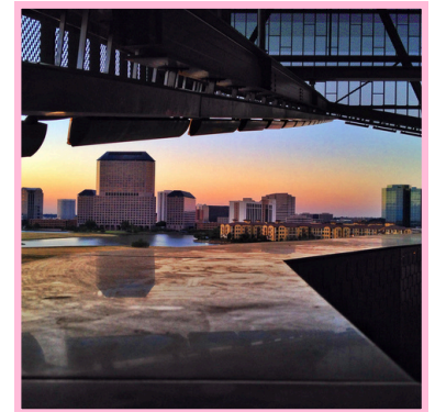
Located in the Heart of DFW

With love already in the Irving air, we're launching a citywide campaign to grow Irving-Las Colinas as a romantic destination—with the help of our partners.