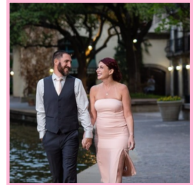
Mandalay Canal Walk