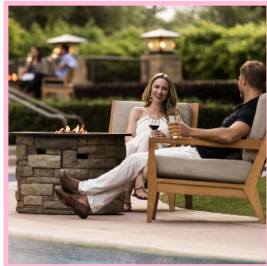
Luxury Romance Stays