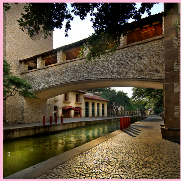
European-Style charm of Las Colinas

Irving has been named the Romance Capital of Texas thanks to a rare mix of European-style charm, waterfront beauty, and elevated experiences—all in a city that's easy to access and easy to fall in love with.