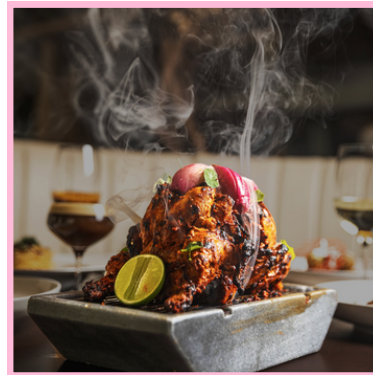
High-End Globally Inspired Dining