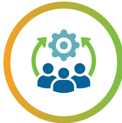
Access and Participation