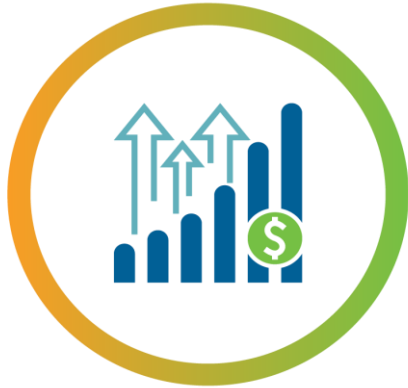
Economic Growth and Opportunity