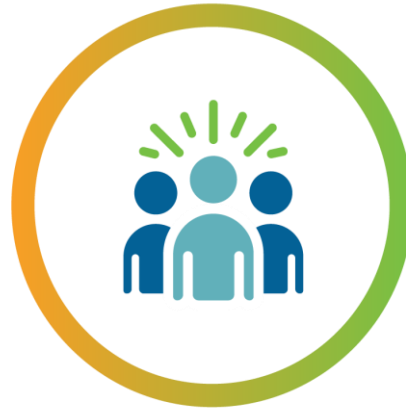
Community Impact and Well-Being