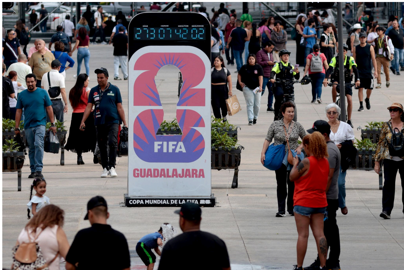
Guadalajara is one of 16 host markets for the FIFA World Cup 2026.

stage matches in their respective countries. Mexico will play in Mexico City and Guadalajara. Canada will play in Toronto and Vancouver. The United States will play in Los Angeles and Seattle.